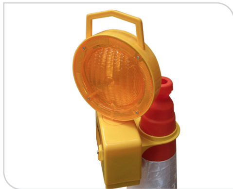
Attaches to cones with bracket

For Traffic cones, the universal cone lamp bracket connects to the existing Maxilite LED Street Works Light and allows for quick, secure attachment to any of our rigid, self-weighted traffic cones.