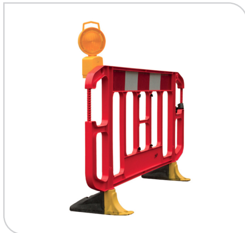
Can be attached to various street work and chapter 8 barriers