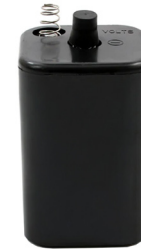
4 STS211858 6V Hazard Lights Battery