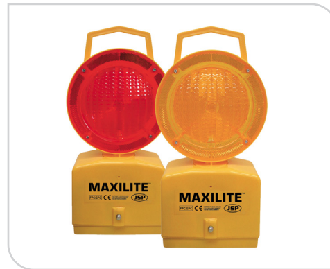
Option for Amber or Red LED lights