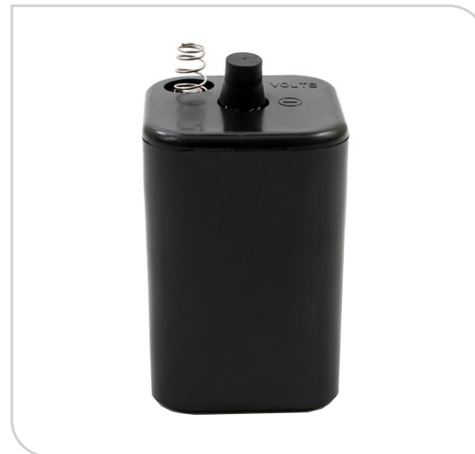
Additional 6V Battery to be added to the LED light (Sold separately)