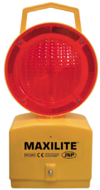
1 STS211844 Maxilite - Red Light