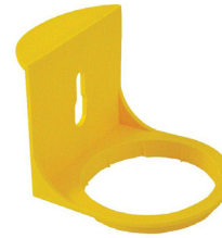
3 STS211848 Maxilite Cone Lamp Bracket