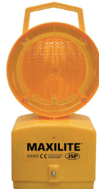
2 STS211846 Maxilite - Amber Light