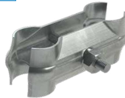
Rota Block Fence Coupler TFS100500

Size and weight of these parts can be requested via email at info@safesitefacilities.co.uk