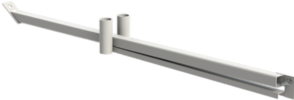
Rota Block Bracket Arm WFS151170