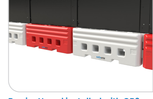
Barrier Hoard installed with GB2