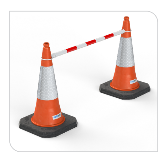
Cone poles in use

With a 360-degree 100mm loop and adjustable length of 1.1m to 2.2m, the telescopic cone pole can adapt to the alignment of any cones, providing a quick and flexible temporary barrier solution. SafeSite can supply both cones and telescopic cone poles, offering a comprehensive and efficient barrier solution at a cost-effective price.