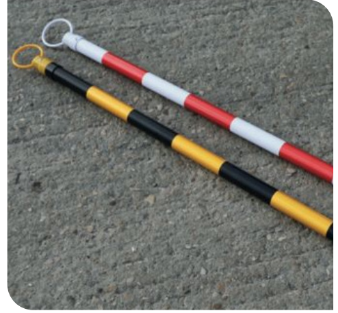
Different colours available